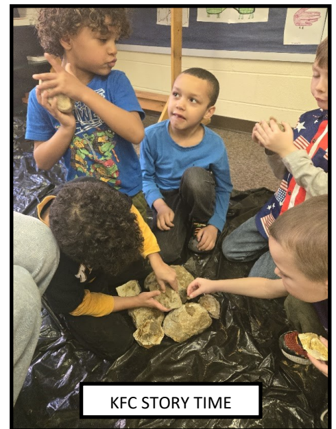
KFC STORY TIME